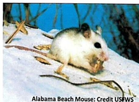
Alabama Beach Mouse: Credit USFWS

The Gulf Environmental Benefit Fund, administered by the National Fish and Wildlife Foundation (NFWF), supports projects to remedy harm and eliminate or reduce the risk of harm to Gulf Coast natural resources affected by the 2010 Deepwater Horizon oil spill. To learn more about NFWF, go to www.nfwf.org .